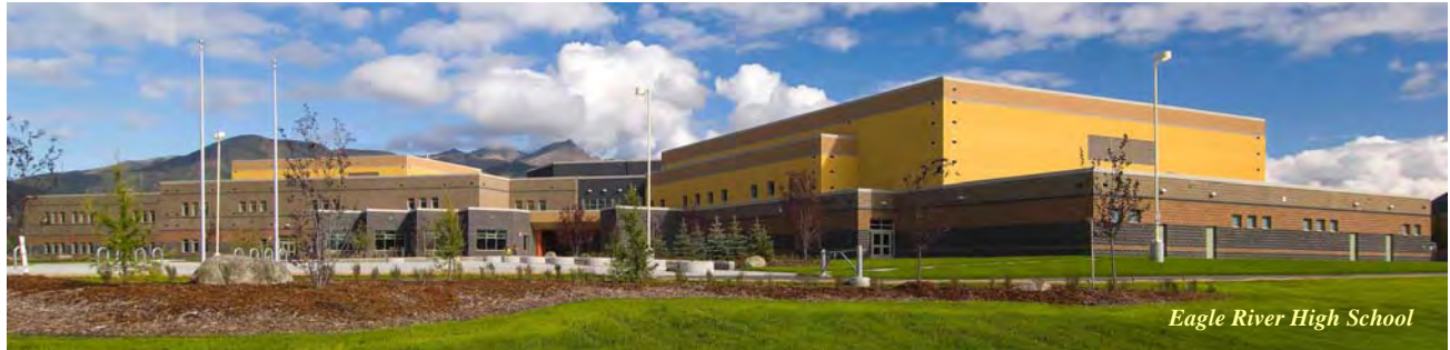
Eagle River High School

Even in the Most Demanding Settings – Both Climates and Usage– Dryvit EIFS is the Answer for Anchorage Schools