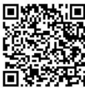
Georgia Aquarium, Atlanta, GA