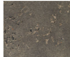
Base: Onyx DDM2: INCA GOLD

Choose from INCA GOLD, STAINLESS STEEL, RUST, OXIDATION, WELDERS ARC (purple hue), ELECTRIC ORANGE patinas and glazes to a number of the Duroplex finishes. Shown below in DDM2 Sahara texture.