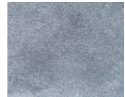
Base: Onyx DDM2: STAINLESS STEEL