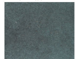
Base: Onyx DDM2: OXIDATION