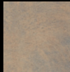
Silk DS III

A decorative faux finish material with performance characteristics that make it perfect for your next project. T1227