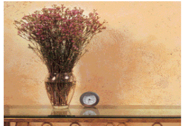
Faulux Strata DS III