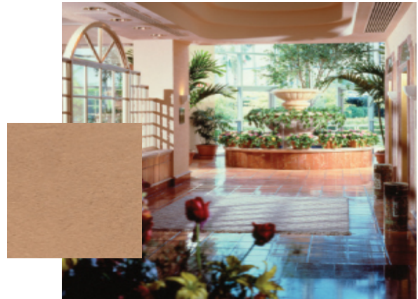
Westin Cypress Creek, Ft. Lauderdale, FL