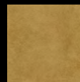
Sedona DS II