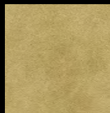
Cirrus DS II