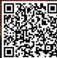
Embassy Suites Mezzanine Level, Houston, TX