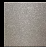
Lace - Pearlescent