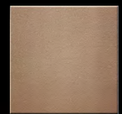
Mist - Pearlescent