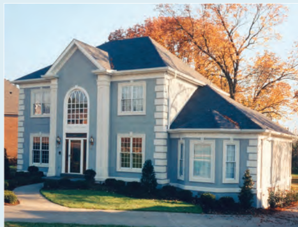
Private Residence | Hendersonville, TN