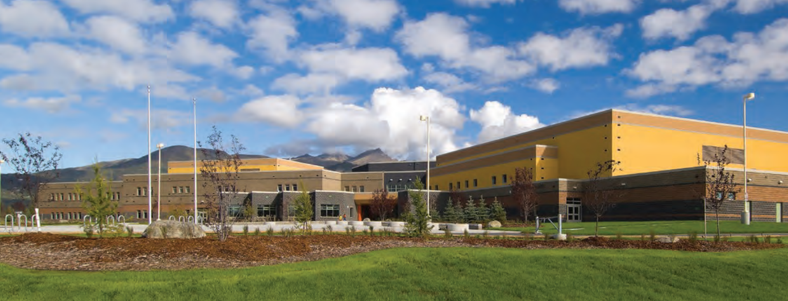
Eagle River High School | Anchorage, AK