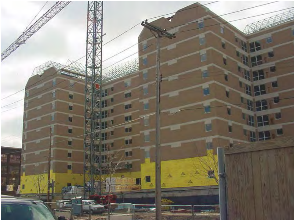
The majority of this apartment building was completed using modular EIFS panels.

the products specified by the architect.