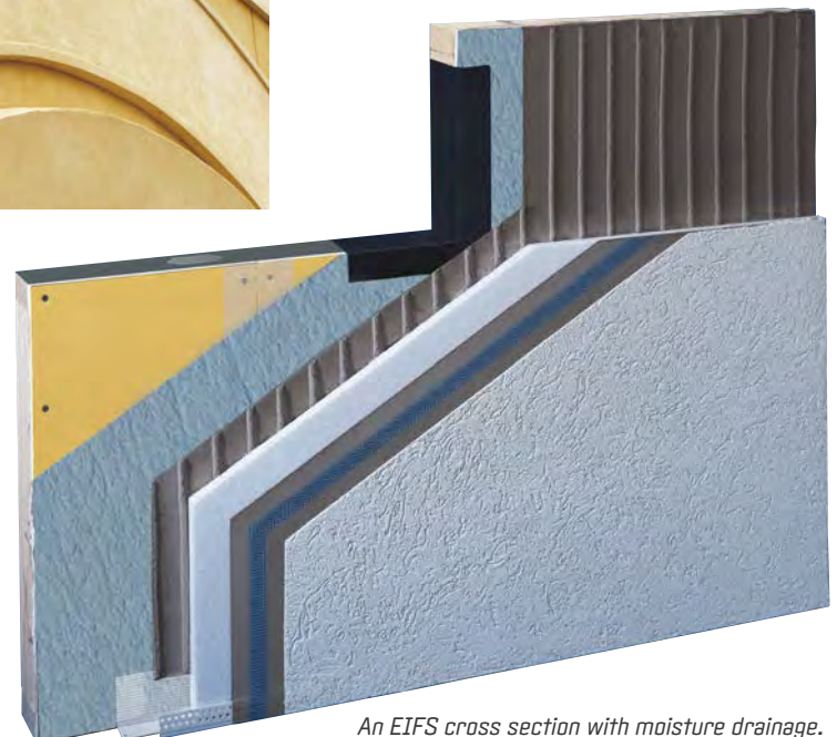
An EIFS cross section with moisture drainage.

type of prefab panel construction. The entire wall — steel studs, sheathing, air/water barrier, adhesive, insulation board, reinforced base coat and finish — is fabricated off site.