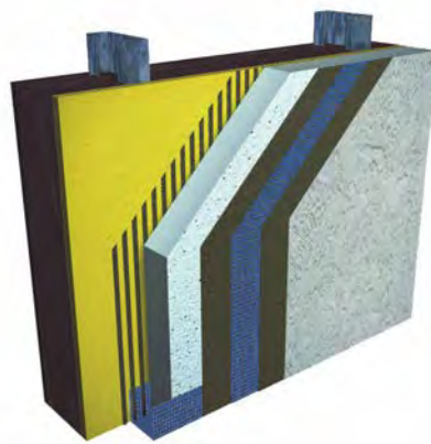
A typical barrier EIF system.

In addition to wall panels, prefabricated EPS shapes can also be created — profiled shapes are cut out of EPS and factory finished with the reinforced basecoat and finish. This allows for the same quality assurance and storage benefits seen with traditional panel prefabrication.