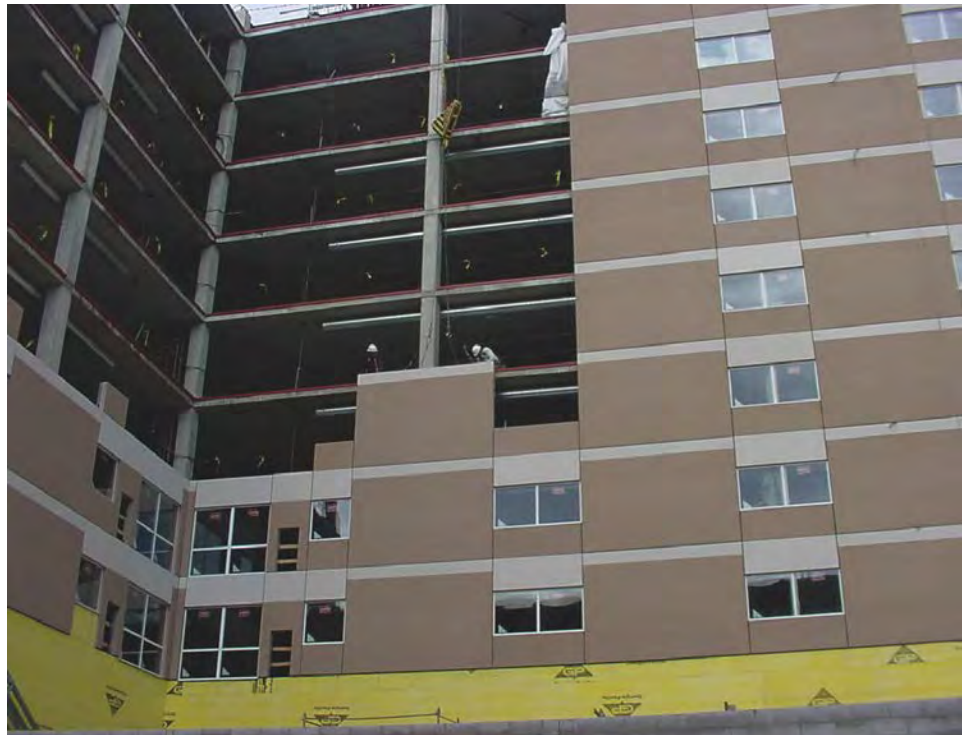
Different-sized panels can be installed, completely finished, to enclose the building quickly and efficiently.

When walls are prefabricated, the fabricator's custom engineer each wall using only