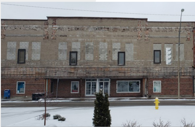
Before the restoration, the facade was deteriorating and let moisture into the wall cavity.