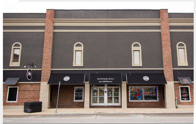
The sleek new finish from Dryvit brought the Boston Hill Center back to its former glory.