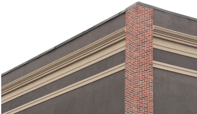
New vertical columns using NewBrick mirror the original brick on the bottom floor.