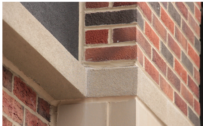
The various Dryvit finishes all come together seamlessly and with proven compatibility.