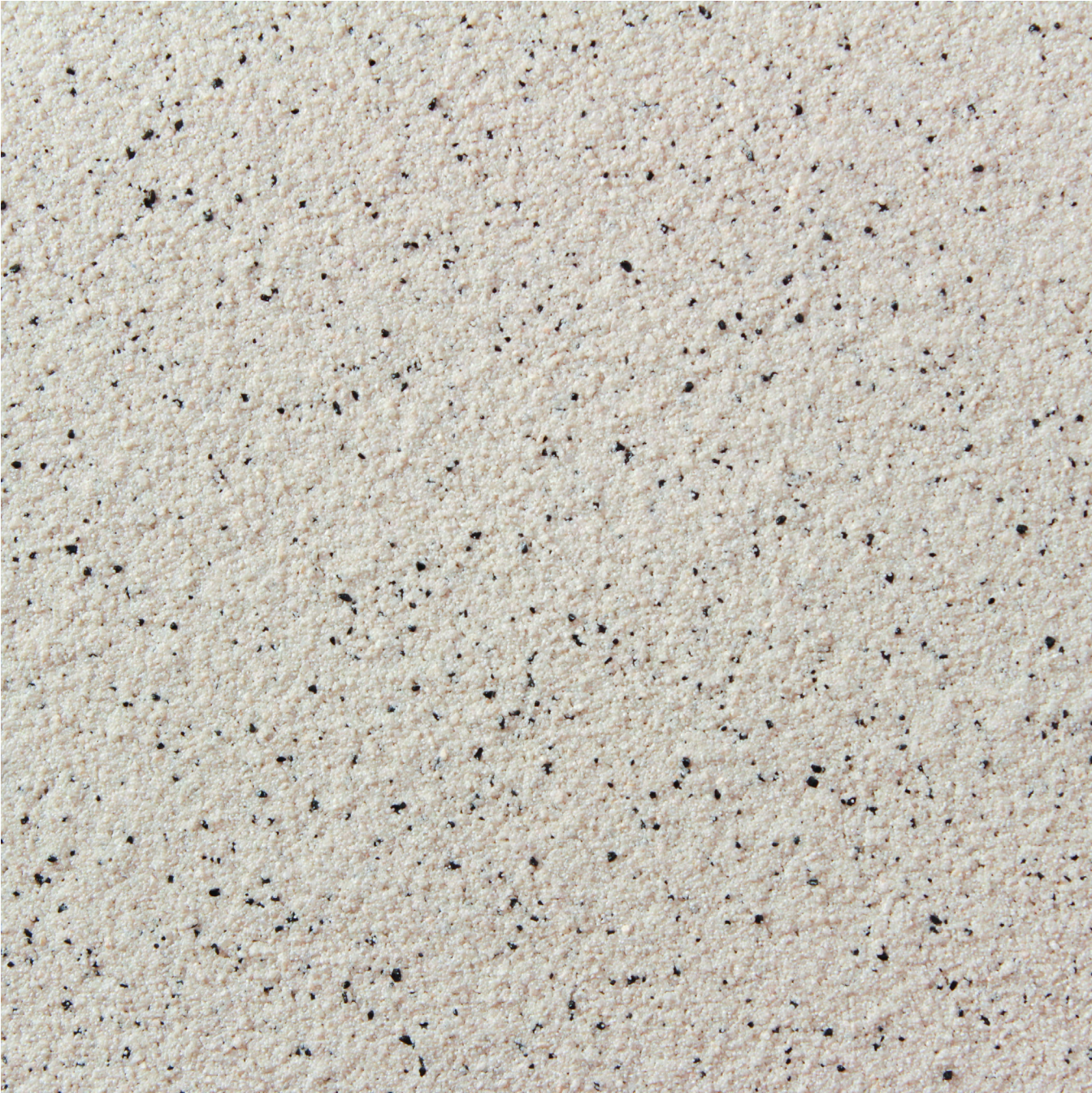
011 Pearl Haze